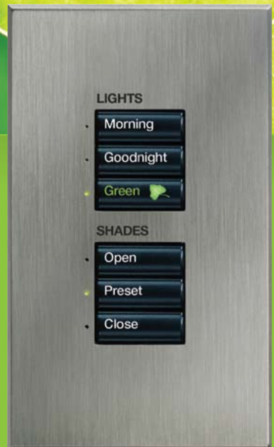
New! seeTouch® keypad with green setback function

Technical Support Center 1.800.523.9466 Customer Service 1.888.LUTRON1 © 11/2008 Lutron Electronics Co., Inc.