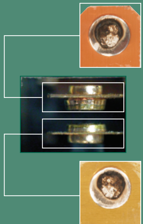
(enlarged photographs, actual contact diameter is 4.05 mm)

As shown on right, 16A Tungsten cycling after 50,000 cycles using Softswitch relays. The Softswitch relays use an additional electronic circuit design to completely eliminate arcing during the switching process.